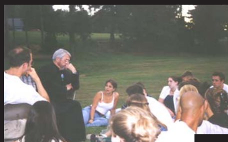
A different fun activity is held each night