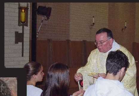
Participation in the liturgy is an essential part of conference life